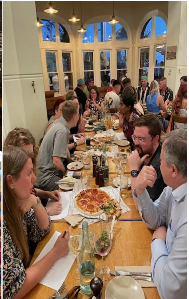
The pictures above are from the most recent regional activities in QLD and WA. Thank you to our regional chairs for sharing!

Want to know more about past or future Branch meetings? Get in touch with your regional chair: https://www.anzsrs.org.au/about/regions