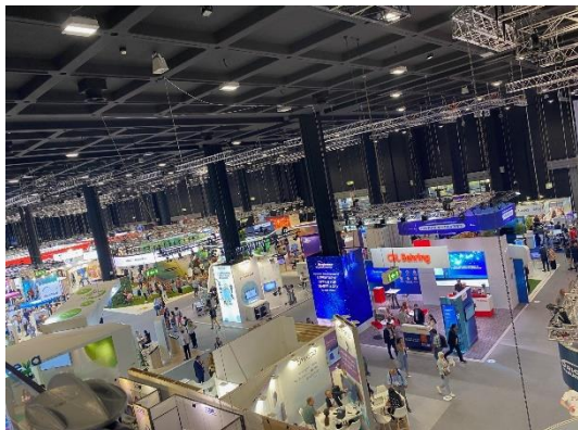
ERS Trade display